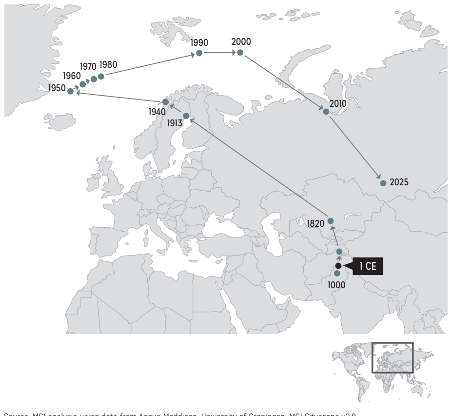
Figure 1: Evolution of the earth's economic center of gravity - 1 CE to 2025*